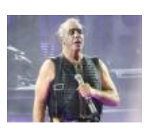
The Rammstein vocalist glorified rape three years ago and caused a scandal