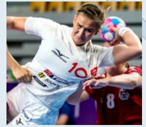
Wbk Handball Fan-atic

Posts: 3108 Joined: Fri Jan 02, 2009 5:40 pm Location: SVK Has thanked: 170 times Been thanked: 143 times