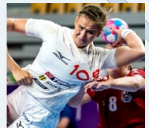
Wbk Handball Fan-atic

Posts: 3108 Joined: Fri Jan 02, 2009 5:40 pm Location: SVK Has thanked: 170 times Been thanked: 143 times